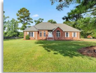
COMPARABLE 2 223 Country Squire Ln Jacksonville, NC