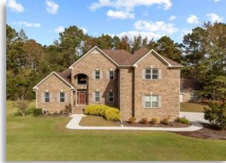
COMPARABLE 1 165 Country Squire Ln Jacksonville, NC