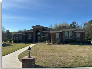
SUBJECT PROPERTY 182 Country Squire Ln. Jacksonville, NC