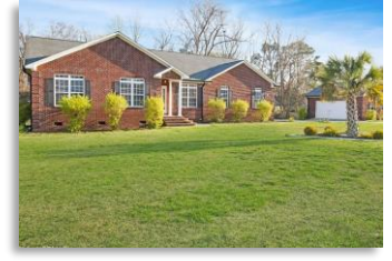
COMPARABLE 3 272 Country Squire Ln Jacksonville, NC